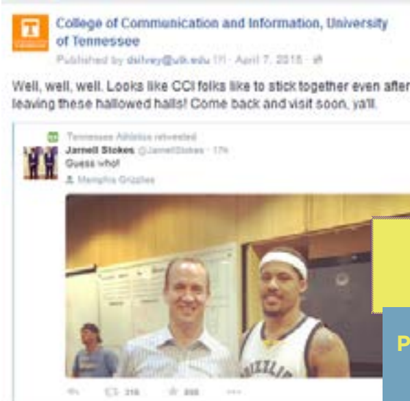
Hanging out at an NBA game