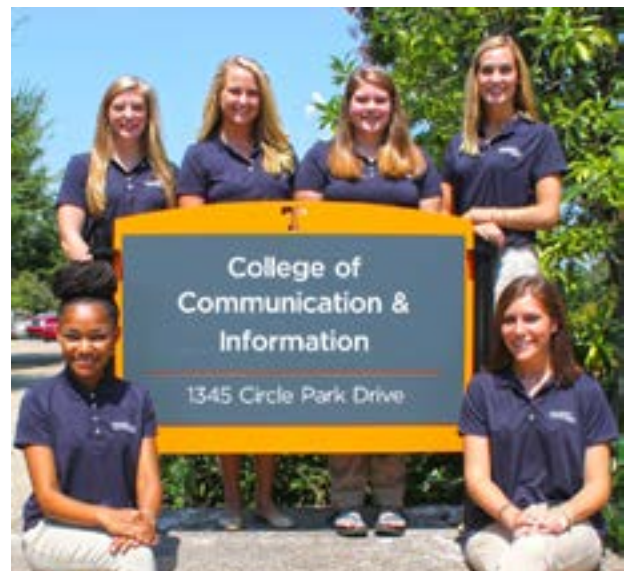
CCI Land Ambassadors provide tours and information about CCI to prospective students and their families