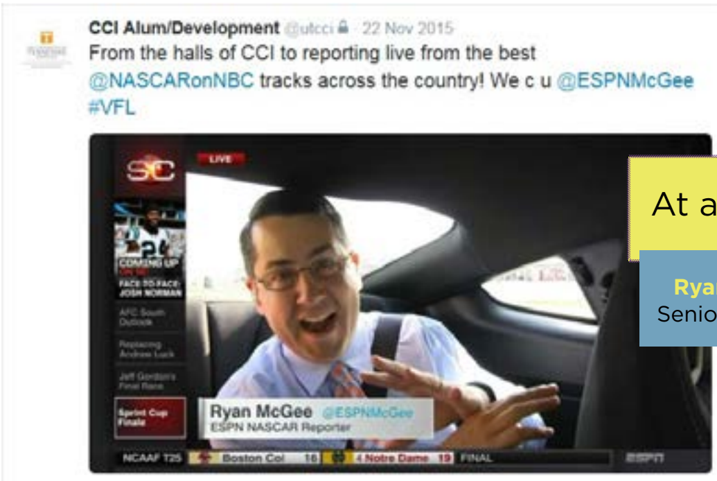
At a NASCAR oval